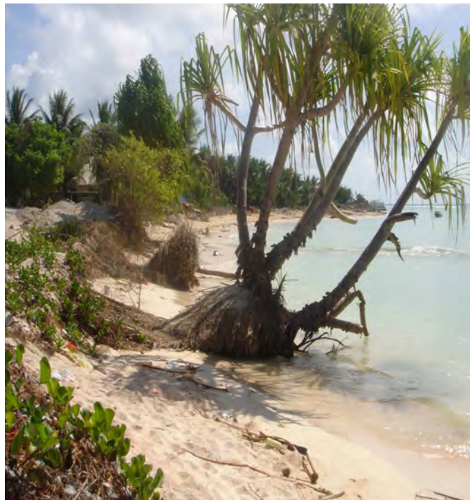
Coastal erosion in a site located west of the Nippon Causeway, Bairiki , Tarawa.