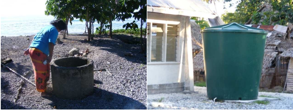
Fig.2e: Sources of water on Marakei

For all villages on Marakei alternative well sites must be identified and reserved for future needs. The construction of concrete water catchments at public places such as schools, church compounds that have huge chapels and meeting houses, maneaba , with aluminum roofing must be encouraged. Wells need to be properly located away from pigsty, toilets and cemeteries, as well as properly secured from surface water flooding and potential pollutants.