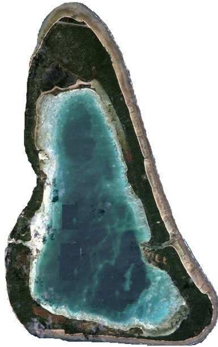
Fig. 1b: Map of Marakei Island

Within the lagoon perimeter are luxuriant mangrove and ironwood ( Pemphisacidula ) bushes. The main economic activities are copra cutting, fishing and babai cultivation. Shark fin and bech-der-mer (boiled and sun-dried sea cucumber) are traded. Handicrafts are also made on a small scale and sent to outlets at Tarawa.