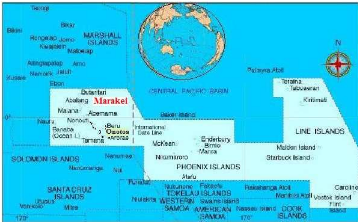
Figure 1a: Islands in the Gilbert Group, Kiribati.