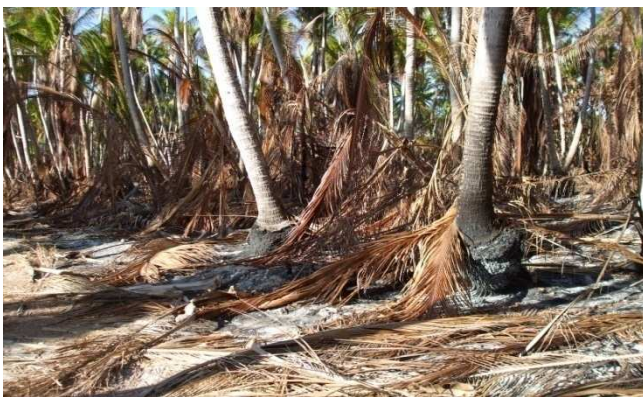
Fig. 2c: Bush fires may be caused by careless land clearing or on purpose

Going around the island several times gave the consulting team members the impression that the practice of clearing land with fire is rife. Of particular interest are Teraereke and Antai areas where some of the fires remained active during the site visits (Fig. c).