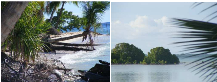
Fig. 2j: Eroded coastline and luxuriant mangrove off the lagoon beach front