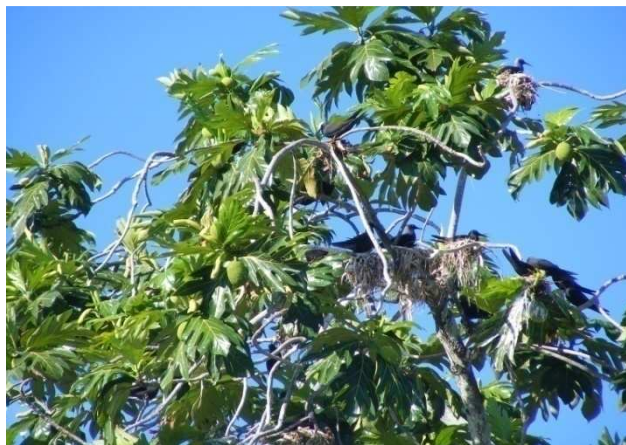
Fig. 2d: Black noddies nesting on breadfruit branches

The avifauna resource of Marakei exists throughout the island but is insignificant in numbers as compared with those in the Phoenix Islands. The common local inhabitants are black noddies and white terns; these occupy mostly uninhabited areas (Fig. 2d). The birds, although small in size, may provide some protein source when marine and terrestrial sources are scarce. Their habitats must be protected by law.