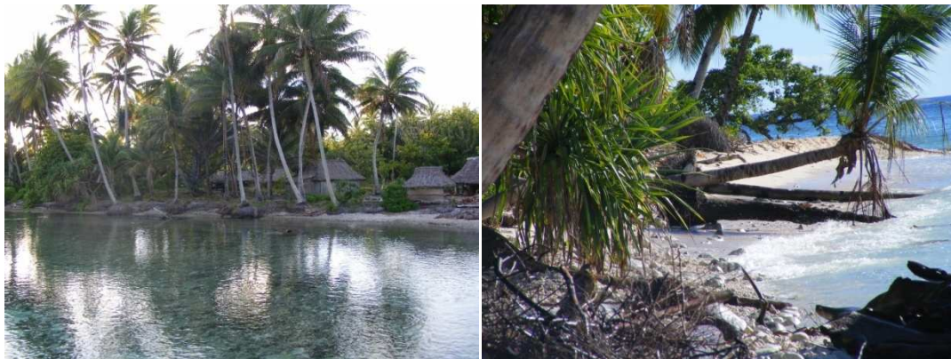
Fig. 2g: Eroded coastlines at Marakei

Observations and assessments from this visit consider coastal erosion on Marakeias a serious problem in certain areas, a threat to properties and people's welfare. The seriousness is measured in terms of rows of coastal vegetation and coconut trees that have disappeared or are standing on the beach (Fig. 2g:), and the flooding of lowlands during extreme high tides. All claimed eroded sites were visited, estimated costs to protect them were determined. Pictures were also taken as proof of their current status (Fig.2g, h), their locations were recorded with a GPS.