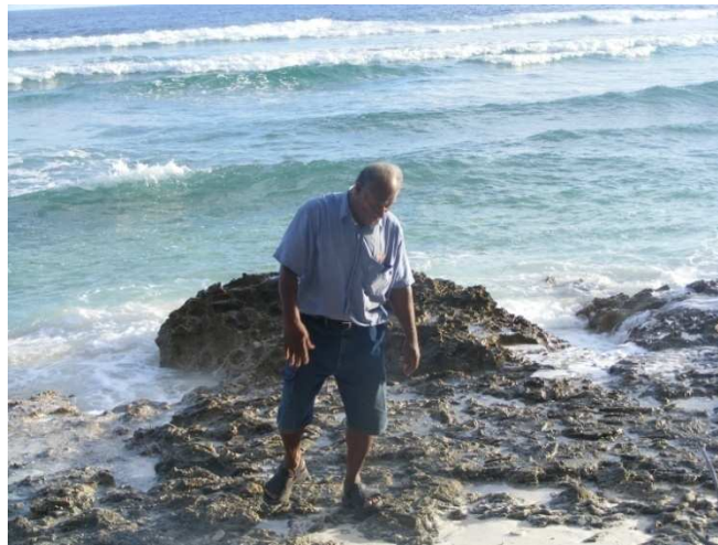
Fig. 1c: A rocky shoreline at the ocean side

The windward shoreline is protected with rocky shores (Fig. 1c) while the leeward western portion is mainly made up of sandy beach that gently slopes down to a reef flat.