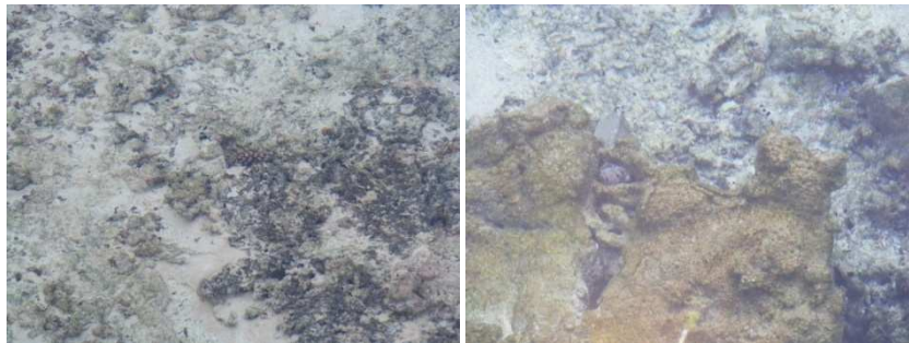
Fig. 2f: Corals in reef pools

To make the Marakei lagoon functional and productive there are several options, one is to widen the exiting passages to their original width, open another channel between Temotu and Raweai(or on the eastern side) or partition the lagoon for aquaculture activities. These will need money, expertise and hard labor which can be obtained from many sources.