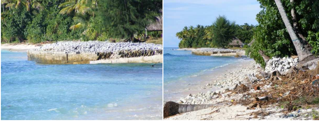
Fig. 2h: A protected coastline and a reclaimed land; the affected neighboring coastline

The most affected area that requires urgent attention is along the entire coastline of Rawannawi village. This is where many destructive activities have taken place to include a boat channel, land reclamation and coral boulder removal. Sooner or later the Island Council's headquarter and other private properties will soon be gone given the fast changes noted by the leading author in a very short period of time of 2005 to 2008. Another area worth of considering as well is at Antai where erosion appears to be serious enough. Whether this coastline has been subjected to aggregate mining it is the residents themselves who know what is happening to it. The approximate cost of protecting the shoreline with concrete seawall is around $200,000 but this depends on the increasing cost of materials. Other areas affected by land reclamation and aggregate mining are yet to be determined. The impact of sea level rise is obscured by human destructive activities such as those mentioned above. On the other hand, the 2007 revised Environment Act has not made any impact on coastal protection on the outer islands but is making progress on South Tarawa and Betio (Tebano-Farren pers. comm., 2008).