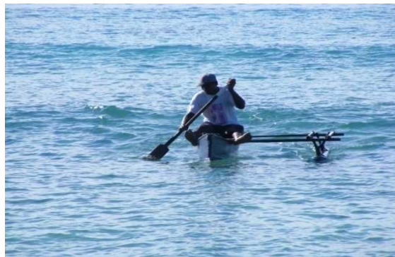
Fig. 2a: A fisherman paddling his canoe

The use of traditional canoes (Fig. 2a) is gradually overtaken by motorized canoes and skiff boats. The use of monofilament gill nets of small mesh size is on the rise and both the lagoon and reef flats are being gleaned. Over one hundred fishing nets were recorded in 2005 with some households owning more than two units; and it is assumed this number has increased since.