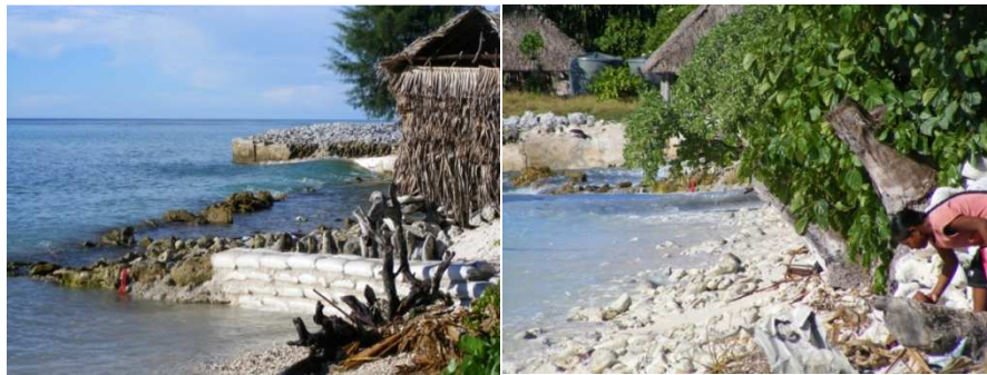
Fig. 2i: Reclaimed lands and eroded neighboring coastlines and properties.

There are no public structures vulnerable to coastal erosion or other natural/human induced causes except those created by humans. Settlements close to reclaimed lands experience coastal erosion and accretion in most instances (Fig. 2i). Land reclamation interferes with natural beach movement thus causing accretion on one side and erosion on the other (Fig. 2j).