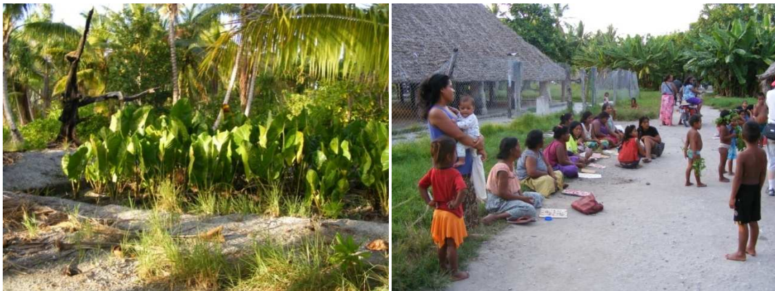
Fig. 2b: Cultivated babai plants (at left); bananas at the background (right)

The cultivation of babaion Marakeihas increased substantially as far as participants are concerned (Fig. 2b). Residents are feeling the pinge of high prices of imported starch items like rice and flour. The lunches brought by participants were dominated by babai ( kaatutu ), a smaller variety that needs little cultivation. Te mai (breadfruit – Artocarpus ) varieties and pandanus - tetou ( Pandanustectorius ) compliment the main staples when in season. Banana varieties ( Musa ) grow on the island (Fig. 2b); papaya ( Carica papaya ) varieties and citrus fruits such as lemon and lime are also grown but in small numbers. The leading author saw tebero ( Ficustinctoria ) fruit only once among the lunches provided; this is a very nutritious berry variety that grows wild in the islands and fruits almost year round. Some participants claimed it is not in fruiting season, others countered saying there are very few wild ones and hardly seen in all villages visited. Te karewe – fresh toddy (a sap from coconut flower) is popularly drank but the impact of drought on coconut trees is significant. Toddy provides a daily intake of Vitamin C. Certain pandanus varieties are more common in villages and appeared not to be doing well away from dwellings. Replanting activities are unheard of perhaps only on small scales at family land level.