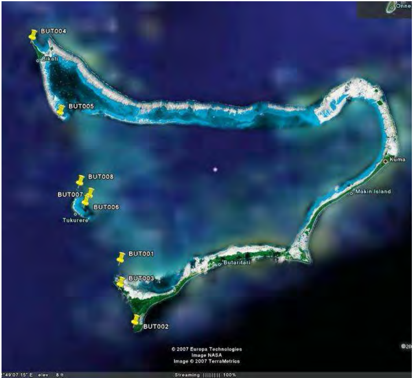
Butaritari site map, created with Google Earth. Sites include permanent monitoring sites and locations visually surveyed during Nov 4-8, 2007 expedition.