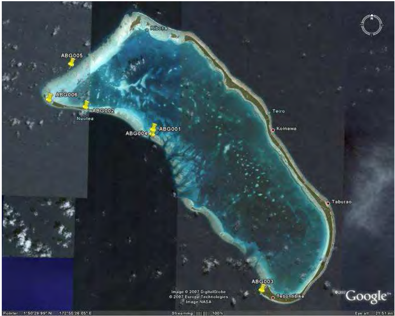
Abiang site map, created with Google Earth. Sites include permanent monitoring sites and locations visually surveyed during Nov 22-24, 2007 expedition.